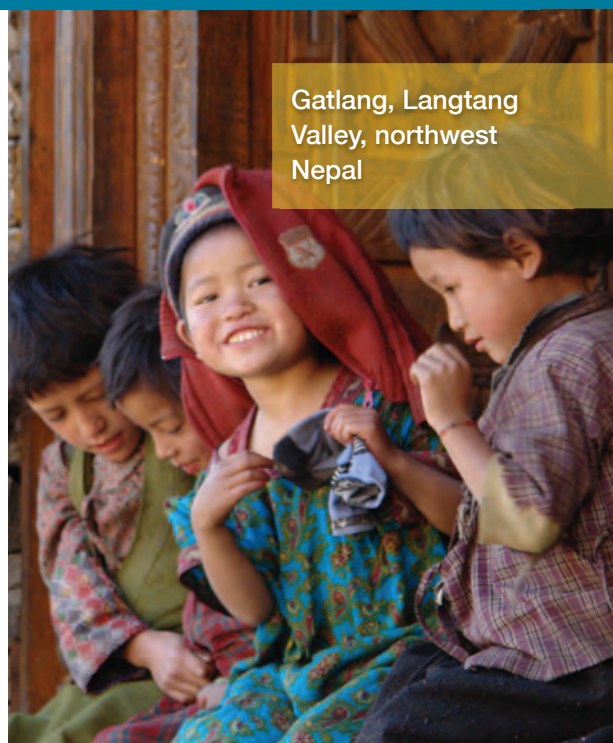
Gatlang, Langtang Valley, northwest Nepal

In many countries, UN agencies are committing significant time and resources towards supporting governments to facilitate CRF development. This provides a huge benefit to time-pressured SUN Focal Points. However, there is a fine balance to maintain to avoid tipping the scales away from government ownership. Ownership across stakeholders is an