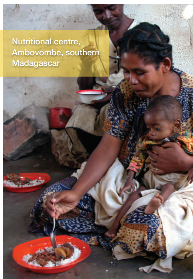
Nutritional centre, Ambovombe, southern Madagascar

Maintaining that drive towards fulfilment of a CRF can prove challenging: investment in genuine, deep consultation and development of a common understanding on nutrition across sectors and stakeholders at the start is a vital part of the process, which takes time, resources and facilitation. Enshrining a common goal for nutrition in legal statutes (policy or signed pacts) or in a national development strategy can assist as a directive to sectors to engage. However, the more inclusive the process of discussion and planning in the early stages and the broader the advocacy, creating recognition of nutrition as a priority development issue for the country, the more effective and efficient the implementation, and hence the achievement of outcomes, is likely to be.