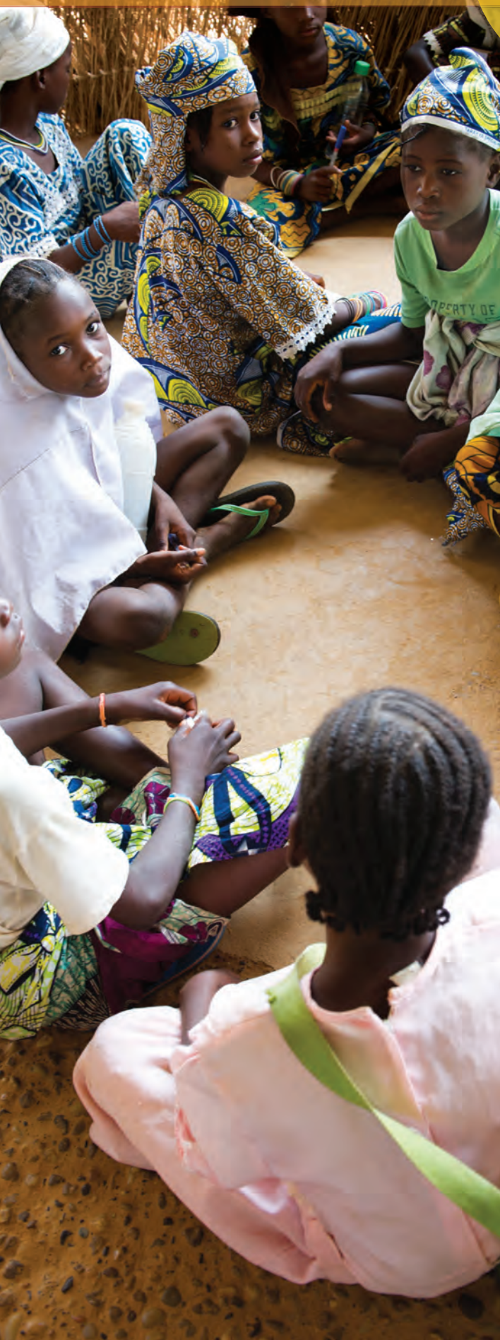
School children in Dalaweve village, Niger