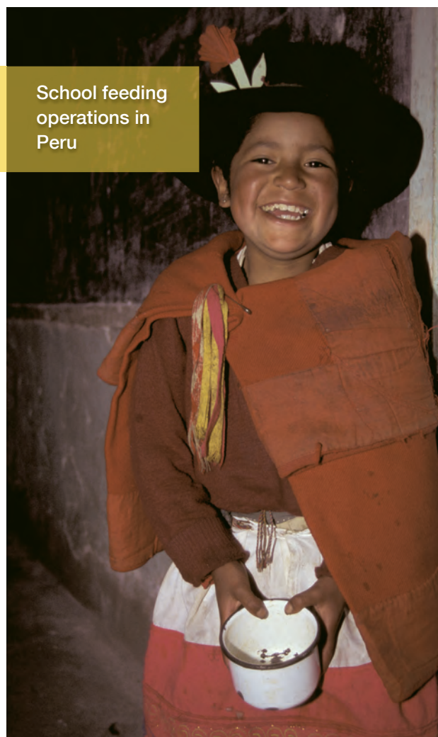
School feeding operations in Peru